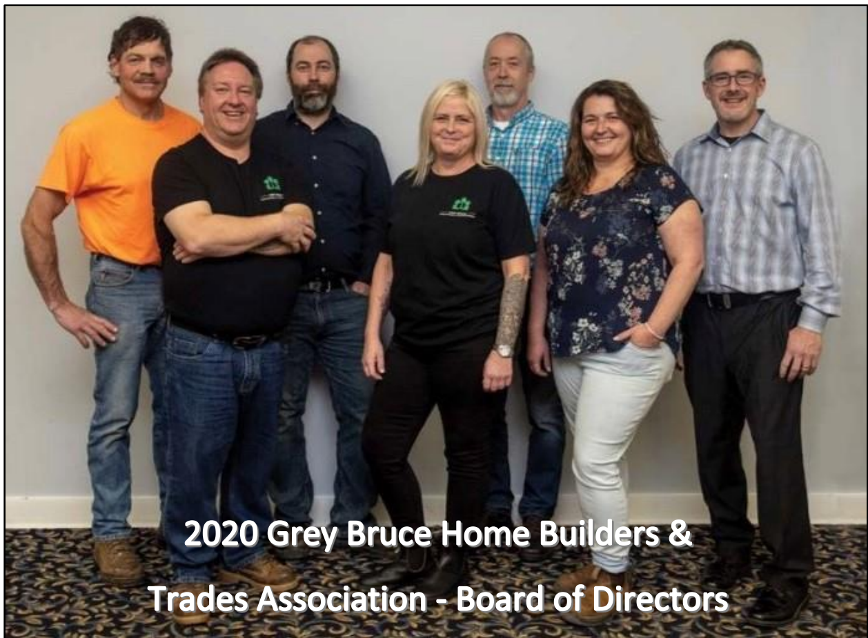
2020 Grey Bruce Home Builders & Trades Association - Board of Directors